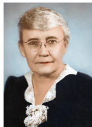
Annie Webb Blanton

Did you know? In 1916, Annie Webb Blanton was the first woman to be elected president of the Texas State Teachers Association. While in office she was able to establish a fund for financing campaigns for securing more support for public schools. Her success as president led teachers to encourage her in a bid for State Superintendent of Public Instruction. Her candidacy was sponsored by the Texas State Women Suffrage Association. In 1918, supported by the State Department of Education and numerous civic organizations, educators and legislators, she was the first woman elected to a public office in Texas.